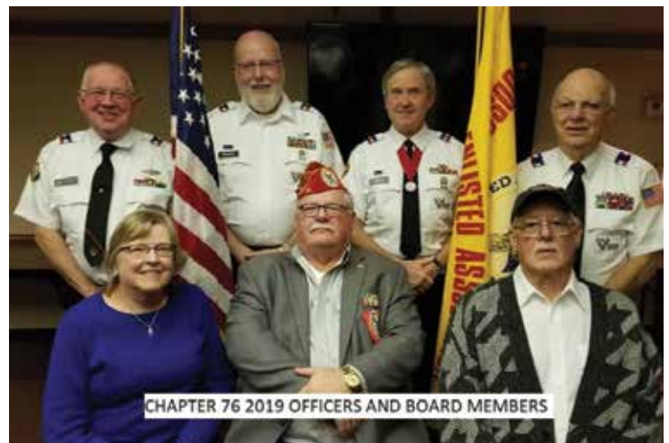
CHAPTER 76 2019 OFFICERS AND BOARD MEMBERS