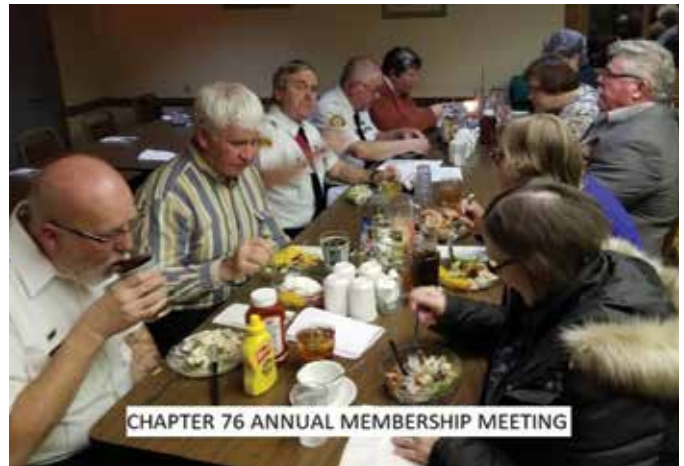
CHAPTER 76 ANNUAL MEMBERSHIP MEETING