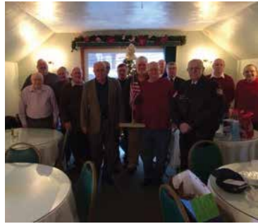
Chapter members enjoying the holidays