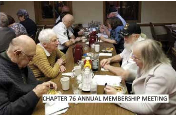
CHAPTER 76 ANNUAL MEMBERSHIP MEETING