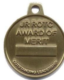
Backside of Medal